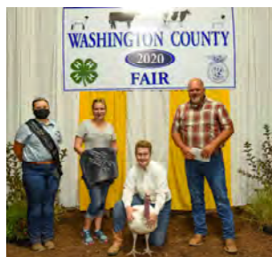
Premier Exhibitor Turkey Gabriella Grabow Wood Heating & AC